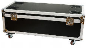
FOS Case Led Follow Spot 600

Flight case with wheels for Led Follow Spot 600.