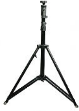
FOS Stand Led Follow Spot 350/600

Flight case with wheels for Led Follow Spot 600.